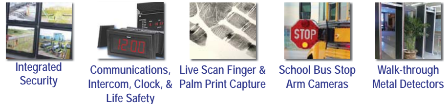
Integrated Security Communications, Intercom, Clock, & Life Safety Live Scan Finger & Palm Print Capture School Bus Stop Arm Cameras Walk-through Metal Detectors