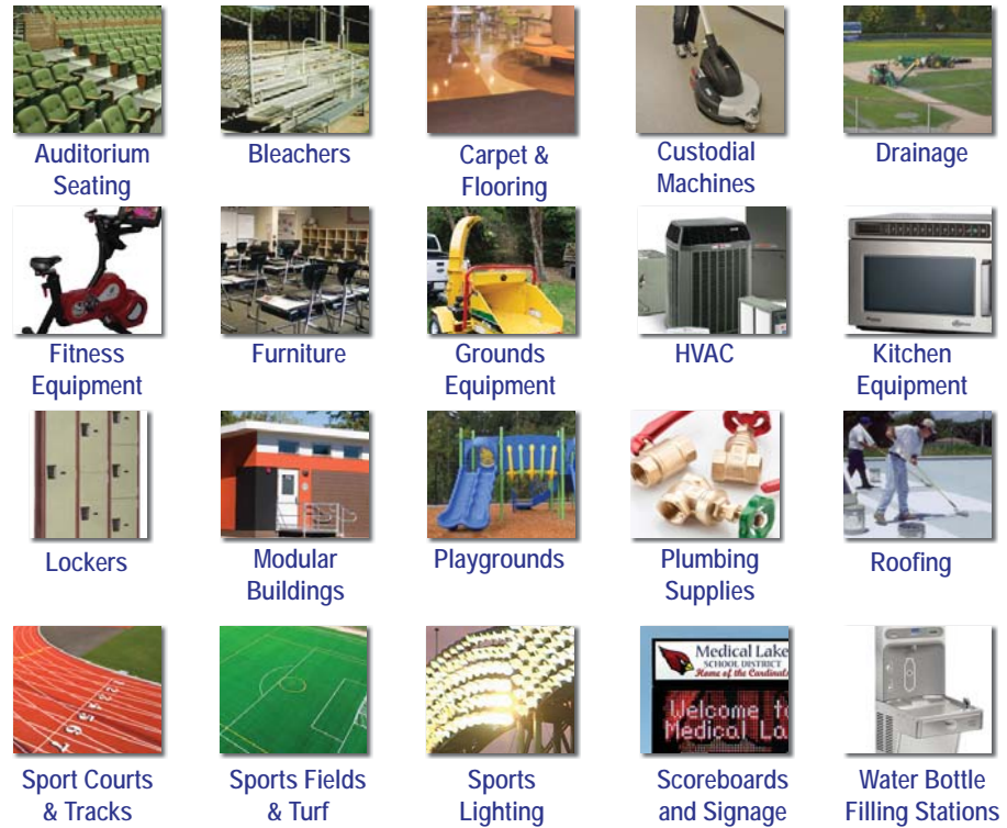
Auditorium Seating Bleachers Carpet & Flooring Custodial Machines Drainage Fitness Equipment Furniture Grounds Equipment HVAC Kitchen Equipment Lockers Modular Buildings Playgrounds Plumbing Supplies Roofing Sport Courts & Tracks Sports Fields & Turf Sports Lighting Scoreboards and Signage Water Bottle Filling Stations