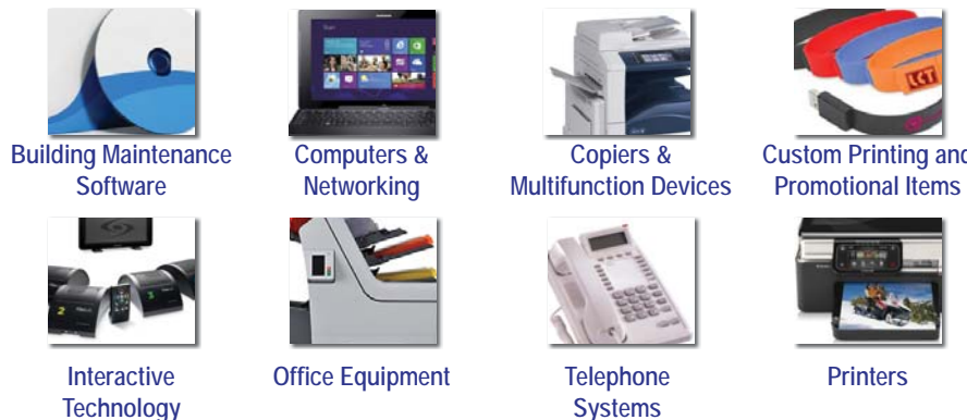
Building Maintenance Software Computers & Networking Copiers & Multifunction Devices Custom Printing and Promotional Items Interactive Technology Office Equipment Telephone Systems Printers

For the most current contract information login at: