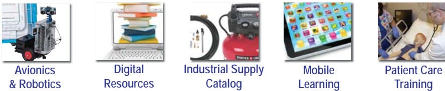
Avionics & Robotics Digital Resources Industrial Supply Catalog Mobile Learning Patient Care Training